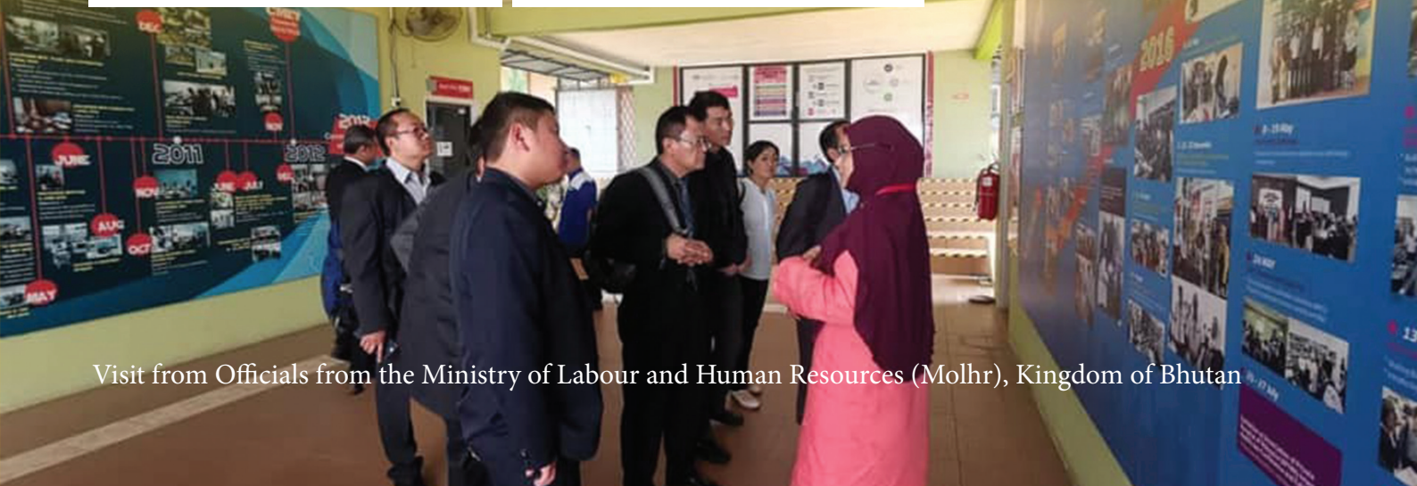
Visit from Officials from the Ministry of Labour and Human Resources (Molhr), Kingdom of Bhutan