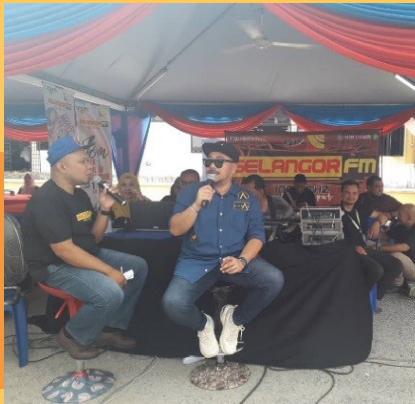
Acong Sweetchild in the house!

Another exciting event for the students was the Meet & Greet session with Acong, Sweetchild – the musical band.