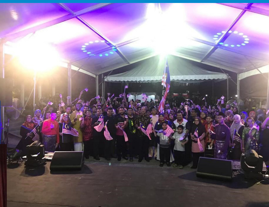
Launching of PSA Merdeka Month 2019

The PSA Merdeka Month was launched on 27 August 2019 in the midst of the busy convocation schedule. PSA Library got the ball rolling with a week-long "Memoir Kemerdekaan" from 26-30 August 2019. Numerous exciting activities were organized for the students like movie shows, Merdeka exhibition, poem writing competition and Merdeka quiz.