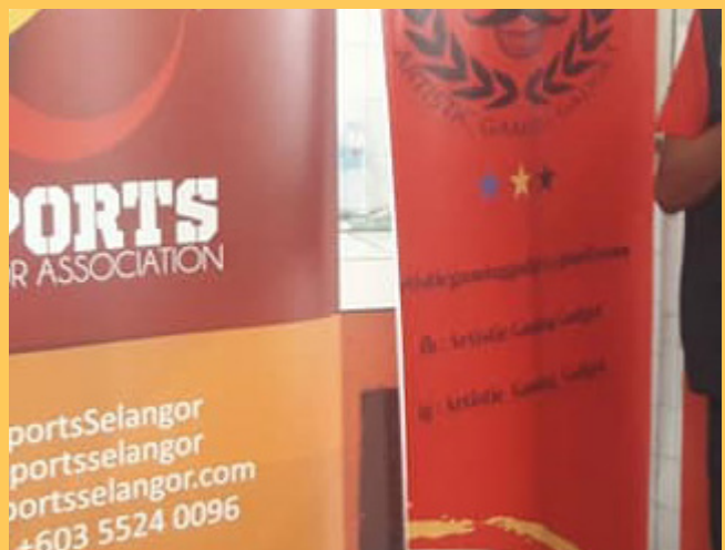
At the Fifa e-sports Tournament

Altogether it was an affair to remember!