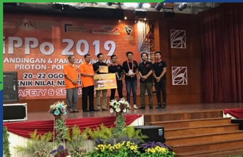
Team MODERNO PSA with their Silver Award